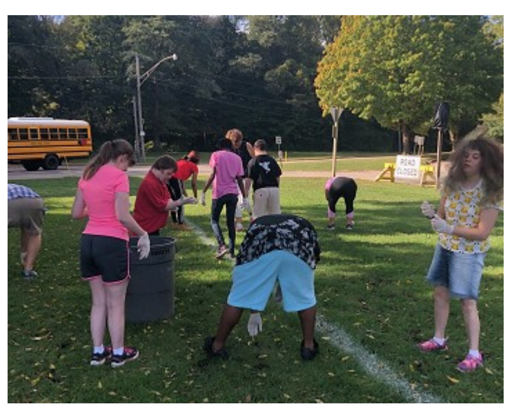
Volunteering at the park!